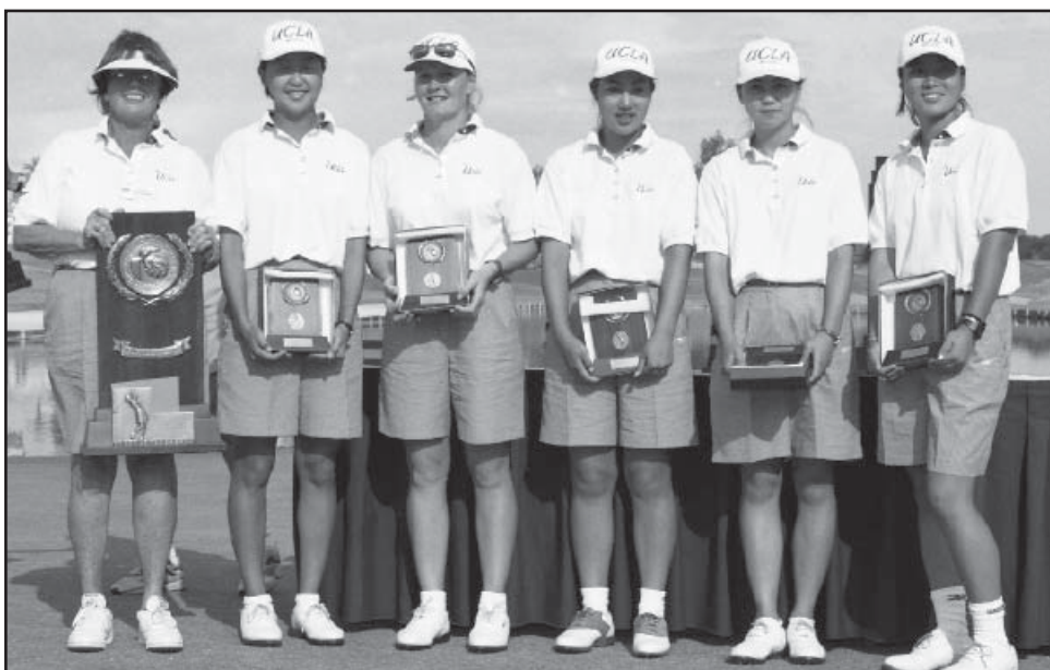
The 1996 Bruins placed second at the NCAA Championship, which UCLA hosted at LaQuinta.