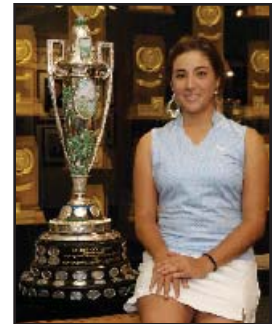
Maria Jose Uribe