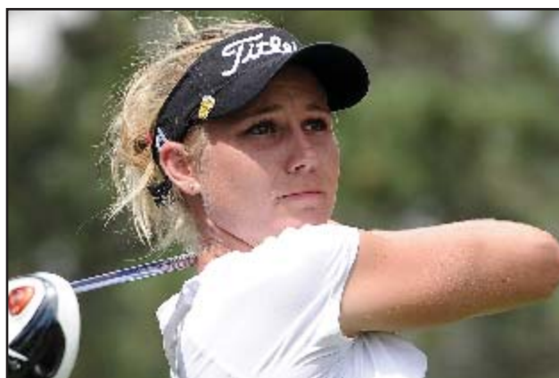
Ryann O'Toole